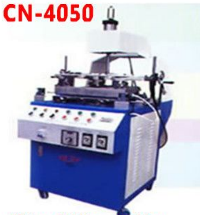
Blister Folding Machine